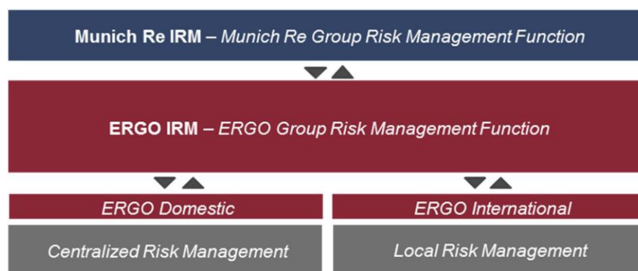
Picture 3. Risk Management Organization within Munich Re and ERGO Group

Methods, standards, processes and policies are defined by ERGO IRM in line with the overall Munich Re Group framework. Local risk management function is responsible for implementing the IRM methodology on a legal entity level. The Management Board of the Company is ultimately responsible for risk management.