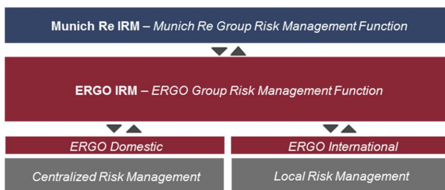
Figure 3: Risk Management Organization within Munich Re and ERGO Group

Methods, standards, processes and policies are defined by ERGO IRM in line with the overall Munich Re Group framework. Local risk management function is responsible for implementing the IRM methodology on a legal entity level. The Management Board of the Company is ultimately responsible for risk management.